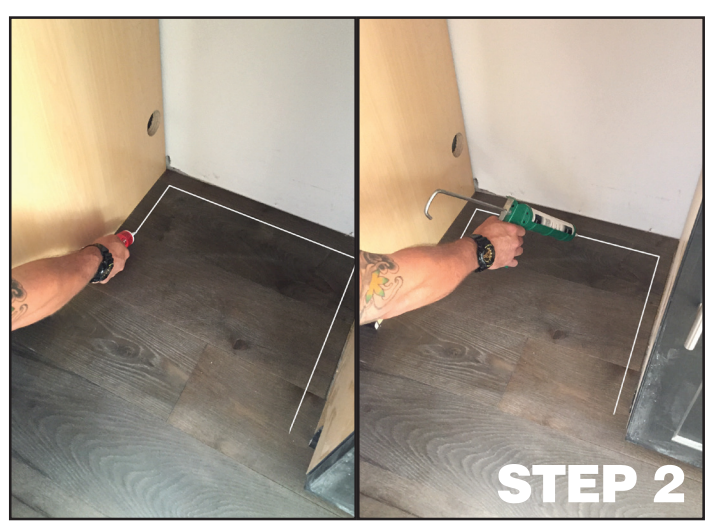
Squeeze a bead of DAP or silicone approximately 2" in from the edge of the dishwasher space. Alternatively, you can apply it directly to the bottom of the Dishwasher Pan, approx. 2" in from the sides.