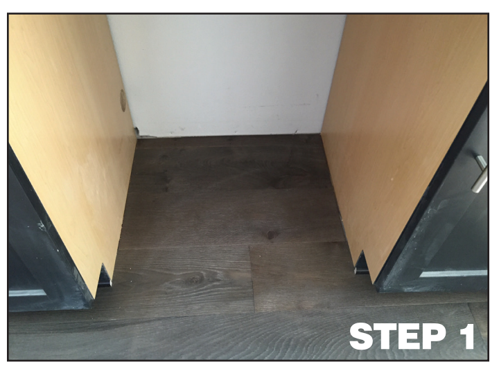
Remove your dishwasher and set it to one side. Make sure to clean up any water or mold from water damage, as well as any debris.