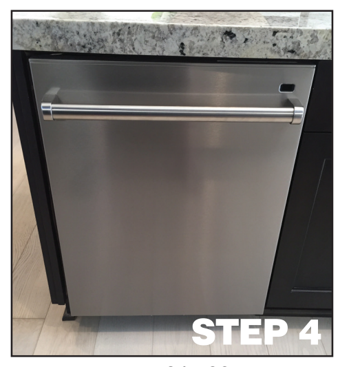
*Note: Let the Pan sit for 24 - 36 hours before reinstalling your dishwasher again. This will allow for the DAP/Silicone to set up and dry. Then re-install your dishwasher, and your home is protected by DRIPTITE!