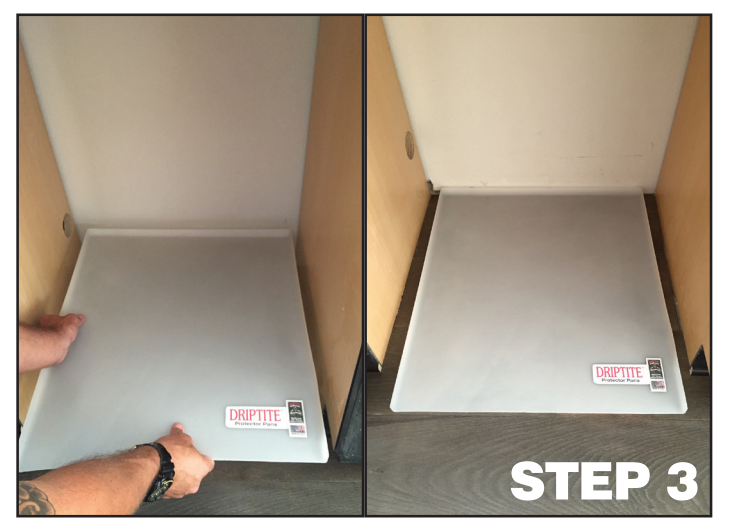
Insert the Dishwasher Pan in the space. Make sure you install the pan approximately 1/2" from the back wall. Use a tape measure to be sure you are centering the pan correctly.